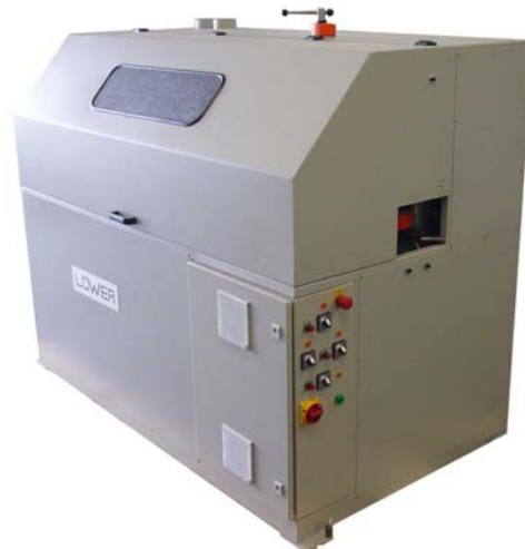
LZ 3 Shown Above