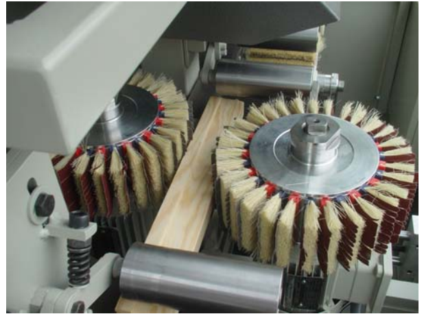
The inside of an LZ 4 with top and bottom heads and hold down rollers shown left. Side heads shown right.